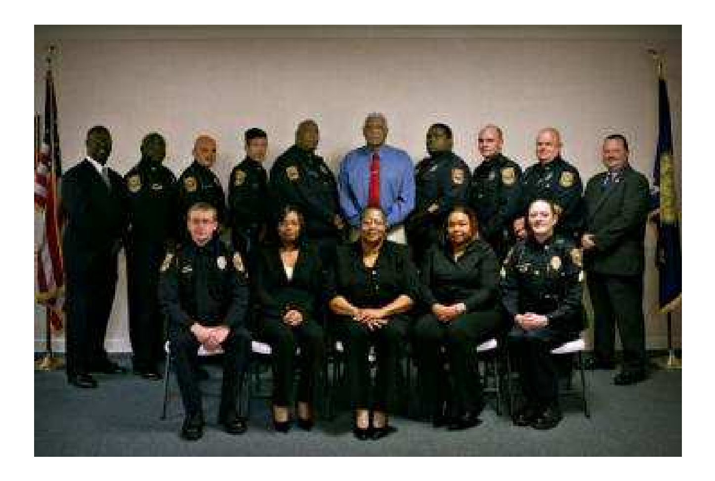
"Setting the Pace...For Today's Law Enforcement"